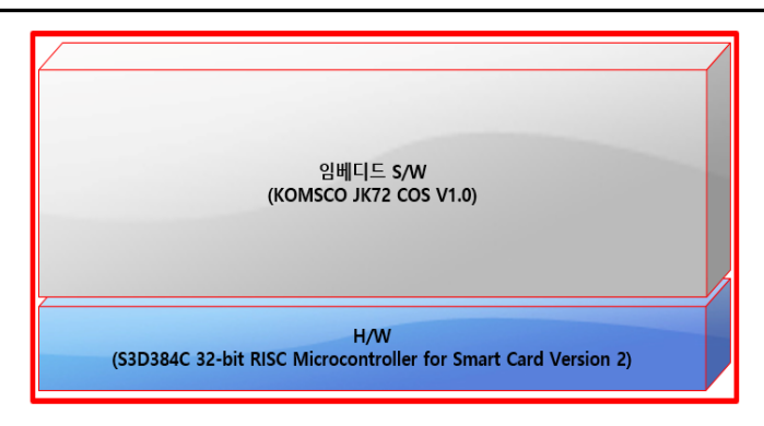
[Figure 2] Physical Scope of TOE

The physical scope of TOE is conceptually composed of the following six parts: